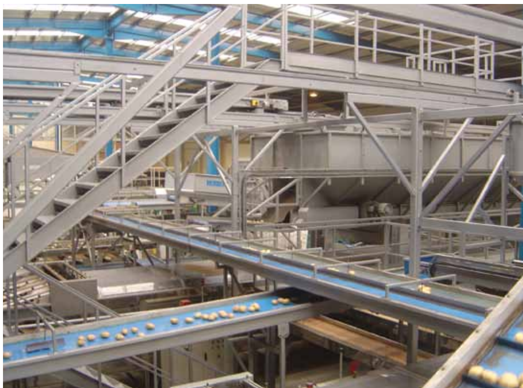
Herbert catwalks in use at major potato processing plant