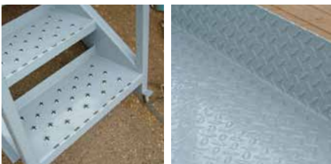
Section of Stairs and Close-Up of Durbar

Contact our Sales Team and arrange an appointment on 01945 430666