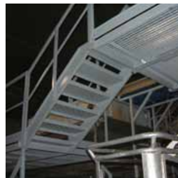
Difficult to reach areas no longer a problem with Herbert's help

Herbert Engineering is able to provide a range of catwalks and walkways to provide safe access to all areas of your business / factory operation.