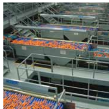
Herbert walkways providing safe access at various levels