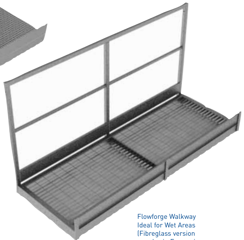
Flowforge Walkway Ideal for Wet Areas (Fibreglass version popular in Europe is also available)